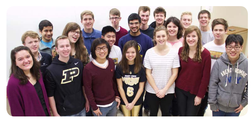
The Statistics Living Learning Community (STAT-LLC) class of 2015 from Purdue University